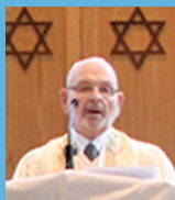
FROM THE BIMA PAGE 2