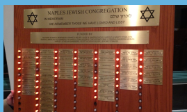
DONATIONS REMEMBRANCES PAGE 7