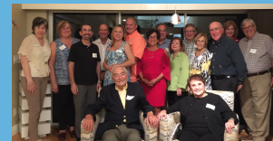
ACTIVITIES PAGE 12-21