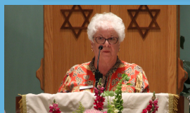
FROM OUR PRESIDENT PAGE 8